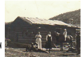
MORIAS HALL FAMILY