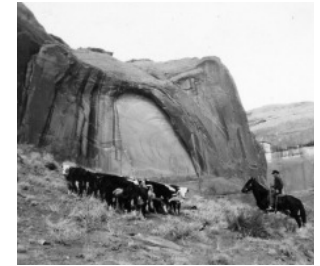
CLYDE KING - DOWN BELOW