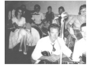
BOULDER DANCE BAND