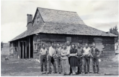
BOULDER HIGH SCHOOL 1940-41