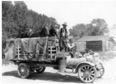
FRANK HAWS GOING TO THE RACES